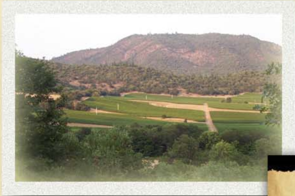
Del Rio Vineyard Rogue Valley, Oregon

D el Rio Vineyards is probably most known for growing elegant Syrah.