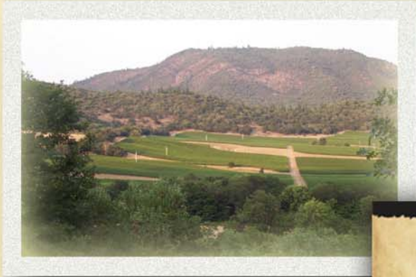
Del Rio Vineyard Rogue Valley, Oregon

D el Rio Vineyards is probably most known for growing jammy Syrah.