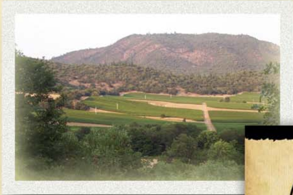
Del Rio Vineyard Rogue Valley, Oregon

D el Rio Vineyards is probably most known for growing jammy Syrah.