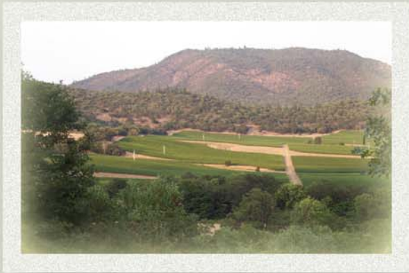
Del Rio Vineyard Rogue Valley, Oregon

D el Rio Vineyards is probably most known for growing jammy Syrah.