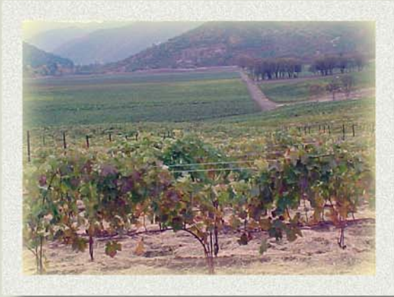
Del Rio Vineyard Rogue Valley, Oregon