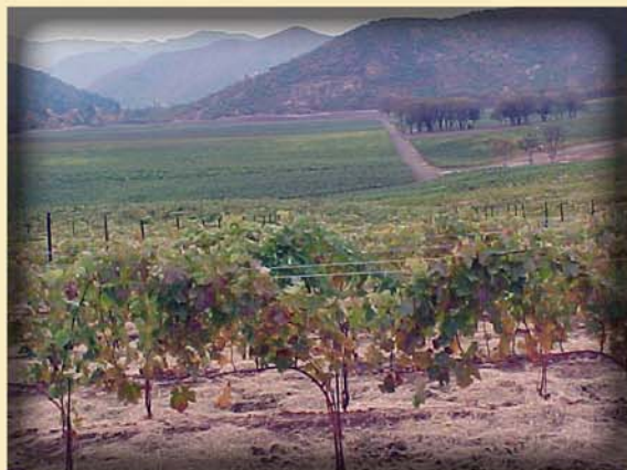
Del Rio Vineyard Rogue Valley, Oregon