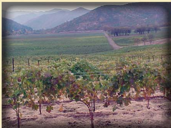
Del Rio Vineyard Rogue Valley, Oregon