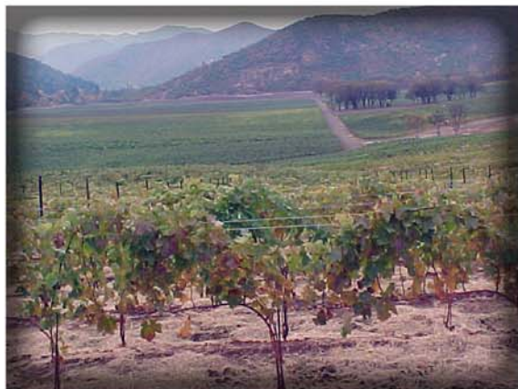
Del Rio Vineyard Rogue Valley, Oregon